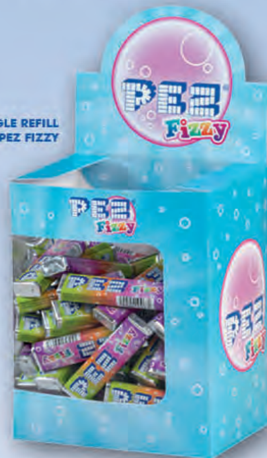
1/100 SINGLE REFILL PEZ FIZZY