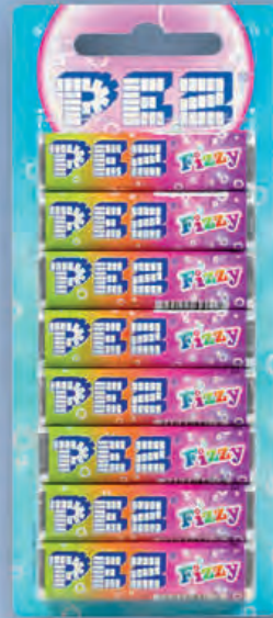
8-PACK BLISTER PEZ FIZZY