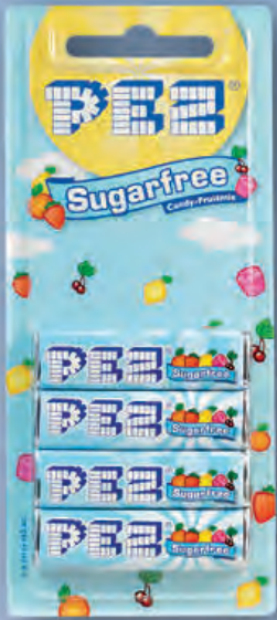
4-PACK BLISTER SUGARFREE FRUITMIX