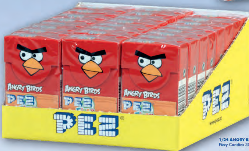
1/24 ANGRY BIRDS Fizzy Candies 30g