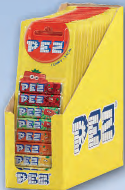
1/12 8-PACK BLISTER FRUIT also available for Cola, Fizzy, Sour Mix, Mango Mix and Liquorice