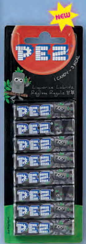
8-PACK EUROBLISTER Liquorice