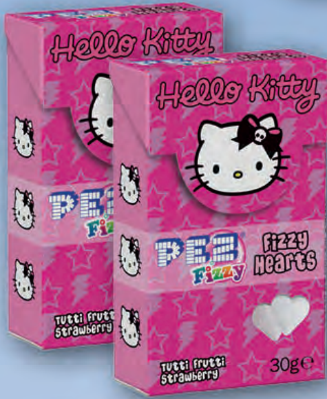
HELLO KITTY 30g