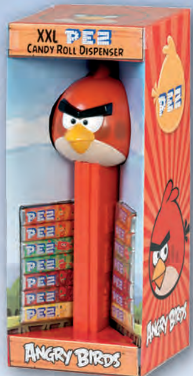
XXL DISPENSER ANGRY BIRDS