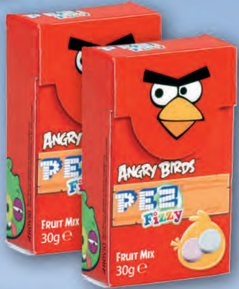
ANGRY BIRDS 30g