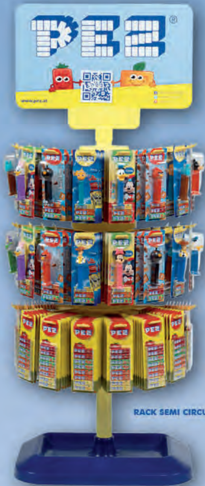
RACK SEMI CIRCULAR