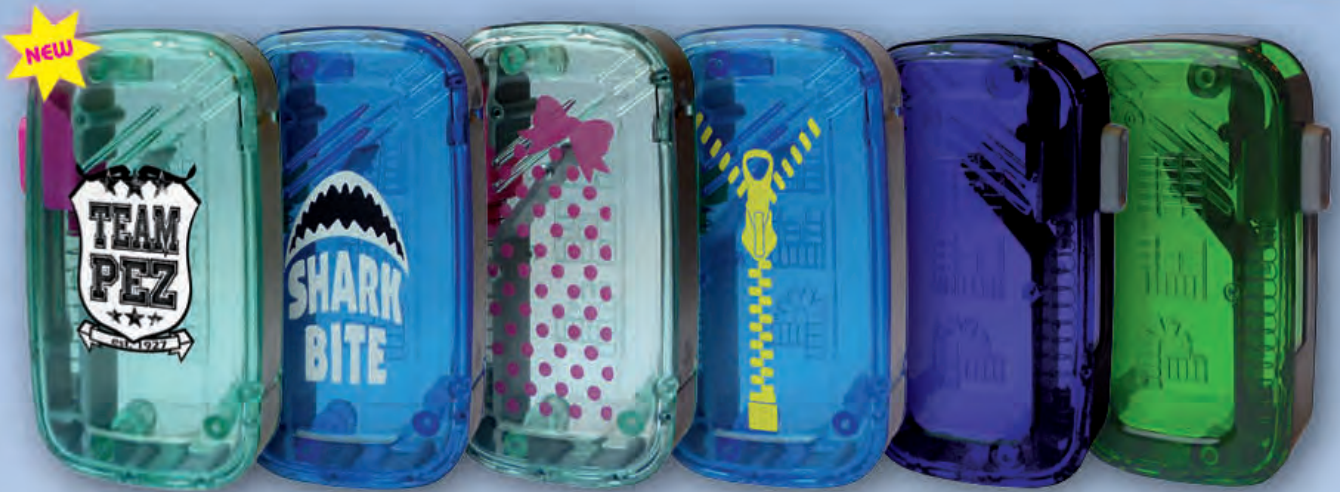
PEZ SOFT DISPENSERS