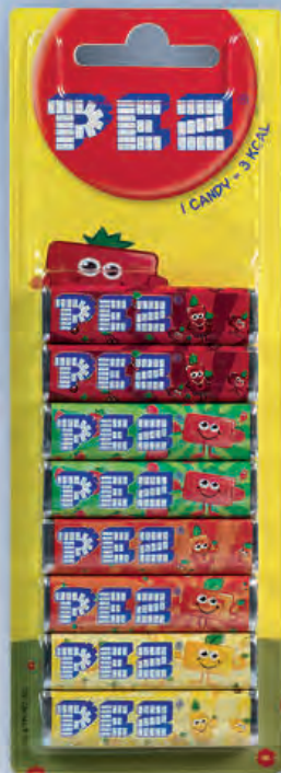
8-PACK EUROBLISTER FRUIT