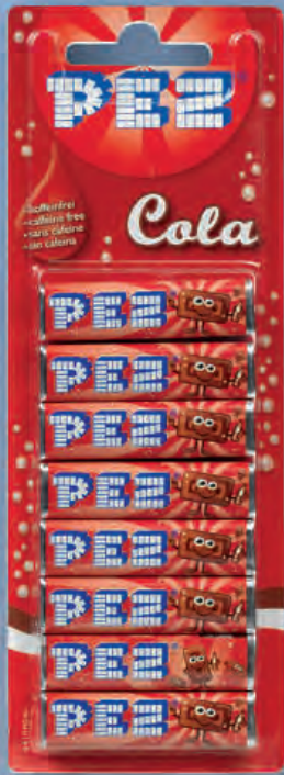
8-PACK EUROBLISTER Cola