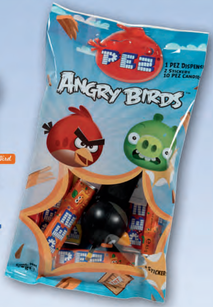
ANGRY BIRDS BAG 85g