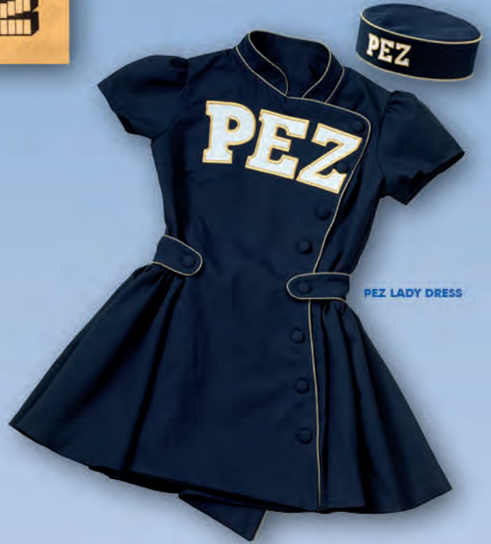
PEZ LADY DRESS