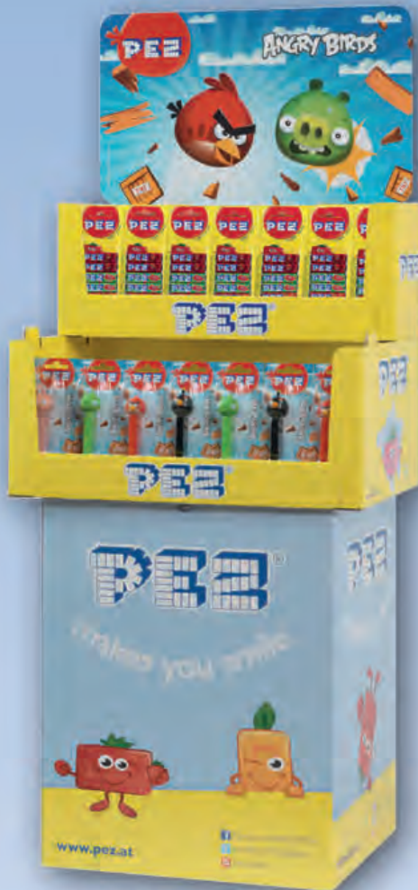
SINGLE STACK DISPLAY