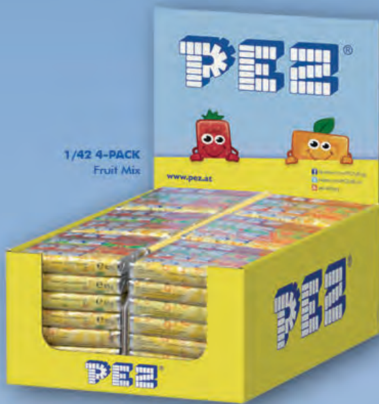
1/42 4-PACK Fruit Mix