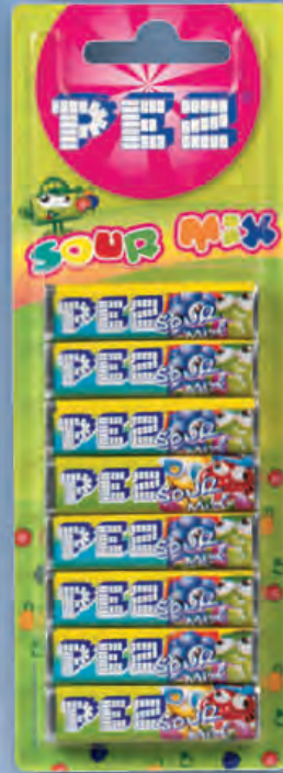
8-PACK EUROBLISTER Sour Mix