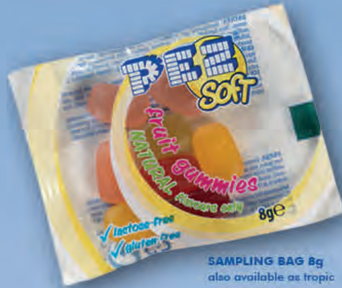
SAMPLING BAG 8g also available as tropic