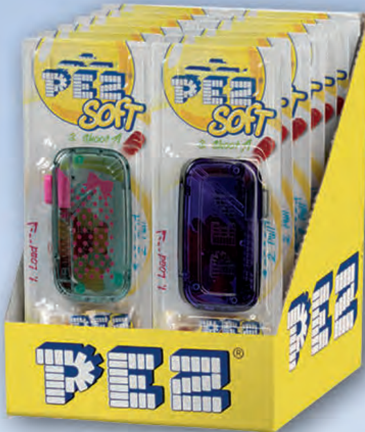
1/12 EUROBLISTER 2-FACING 1+20g