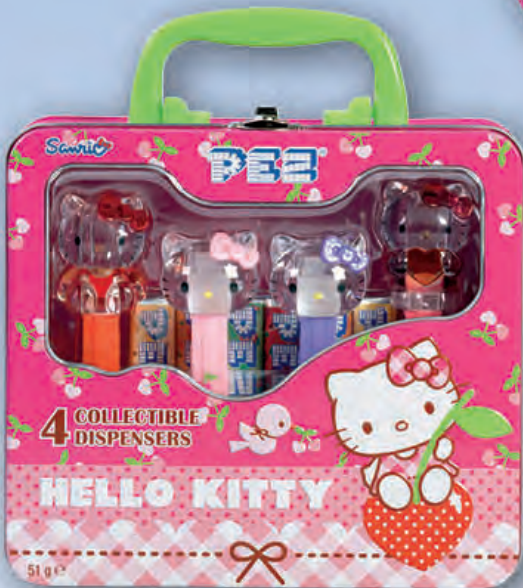
HELLO KITTY TIN