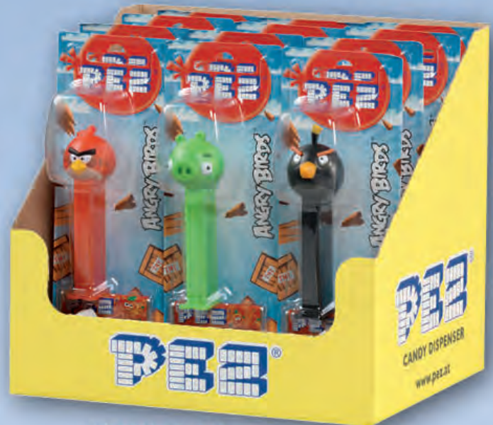
1/12 EUROBLISTER 1+3 also available for 1+2 and 1+1