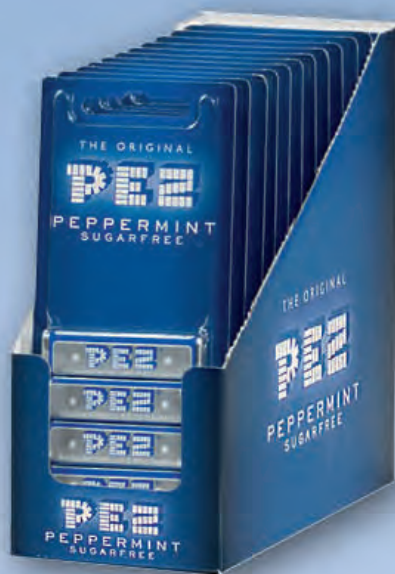
1/16 BLISTER 4-PACK