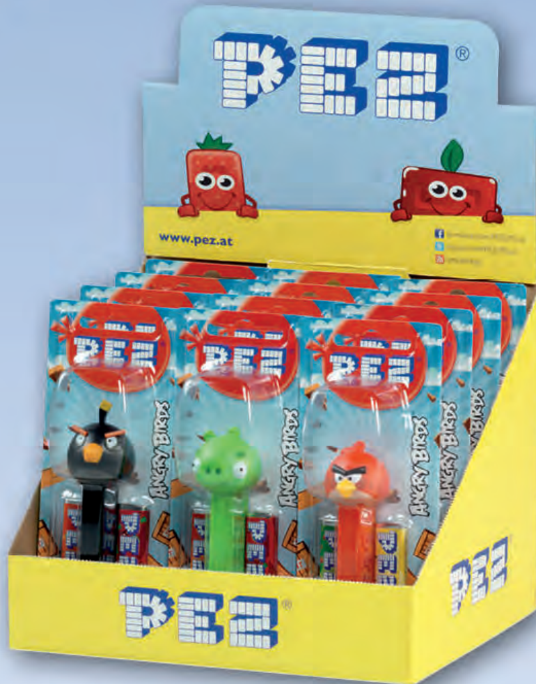
1/12 IMPULSE BLISTER 1+2 also available for 1+1