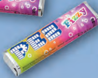
1/42 4-PACK PEZ FIZZY