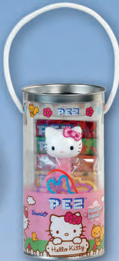
HELLO KITTY GIFT CAN