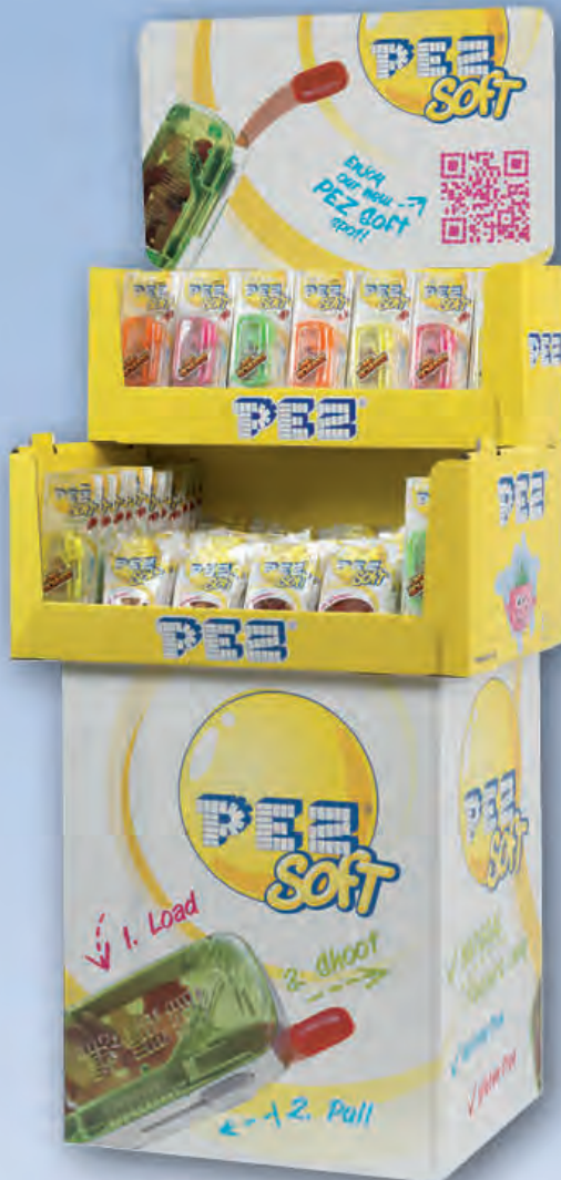
SINGLE STACK DISPLAY