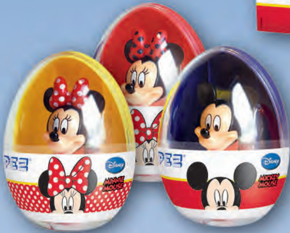
MICKEY & MINNIE EGG