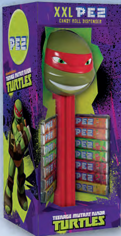
XXL DISPENSER TURTLES