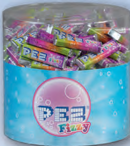
1/150 PEZ FIZZY