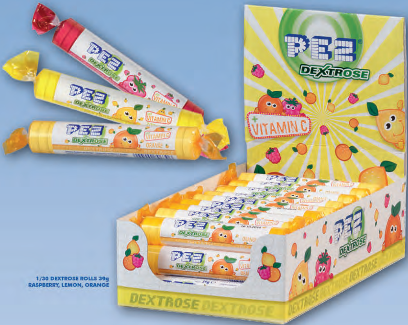
1/30 DEXTROSE ROLLS 39g RASPBERRY, LEMON, ORANGE