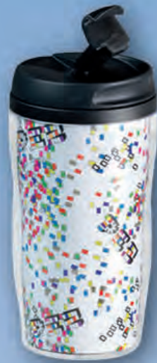
COFFEE 2 GO CUP