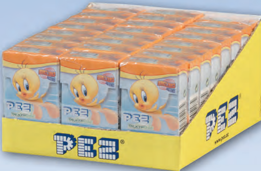
1/24 DEXTROSE 30g