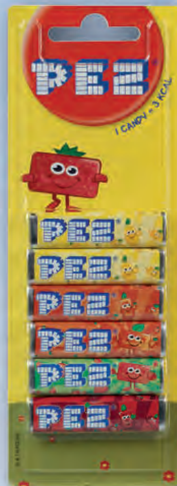
6-PACK EUROBLISTER FRUIT also available for Cola, Sour Mix and Fizzy