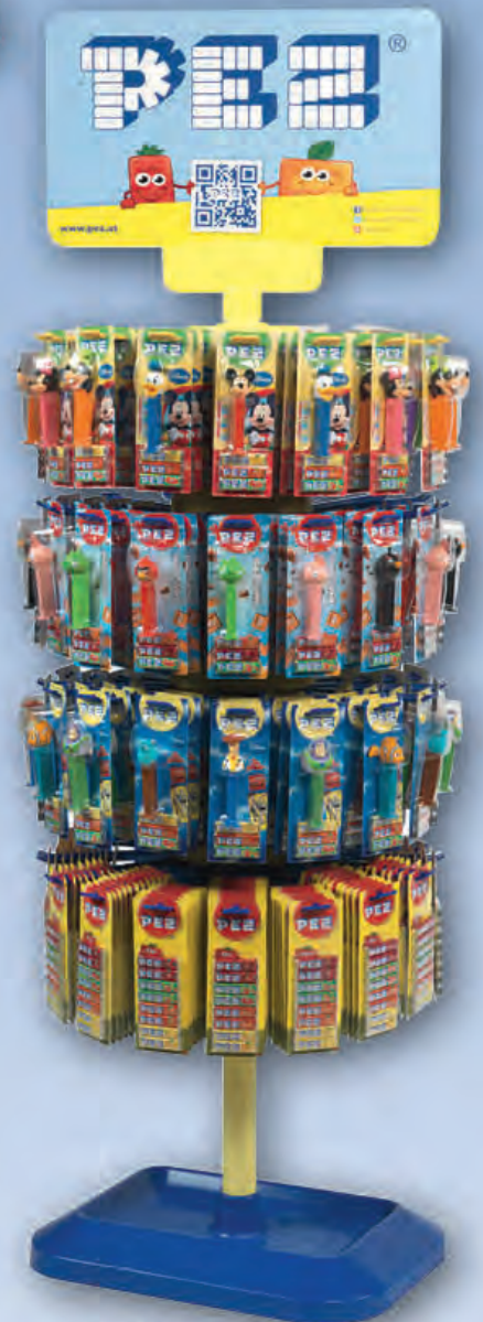
RACK LARGE CIRCULAR