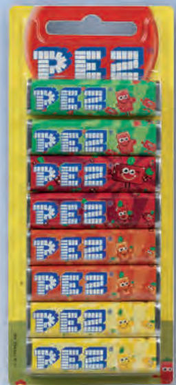
8-PACK BLISTER FRUIT also available for Cola and Fizzy