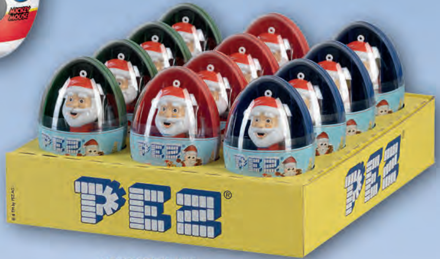
1/12 CONTAINER 1+4 (X-Mas or Easter)