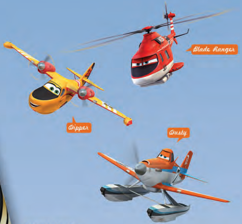
PLANES 2 BAG 85g