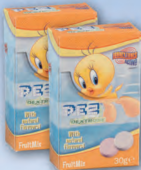
TWEETY DEXTROSE 30g