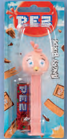
IMPULSE BLISTER 1+1