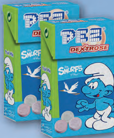
THE SMURFS DEXTROSE 30g