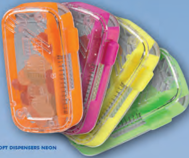
PEZ SOFT DISPENSERS NEON