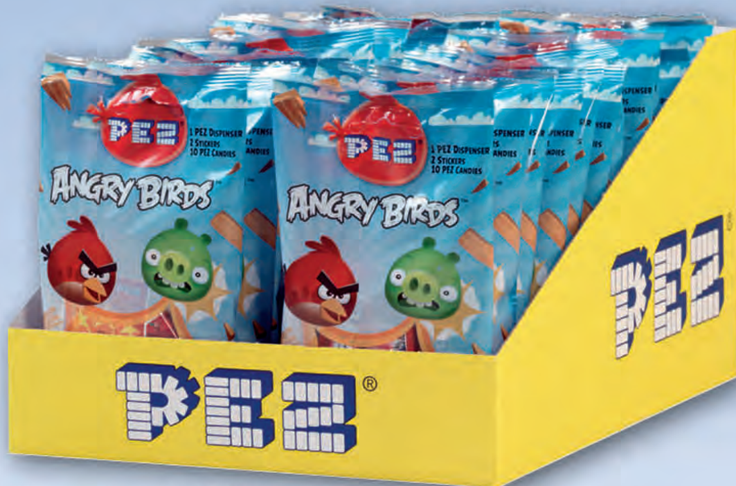
1/24 Bag Display For all 85g Bags