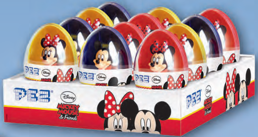
1/12 MICKEY & MINNIE EGG 1+4