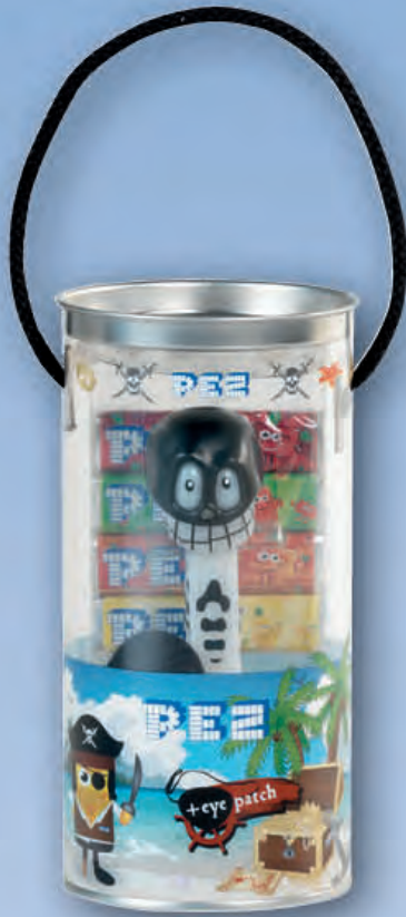
PIRATES GIFT CAN