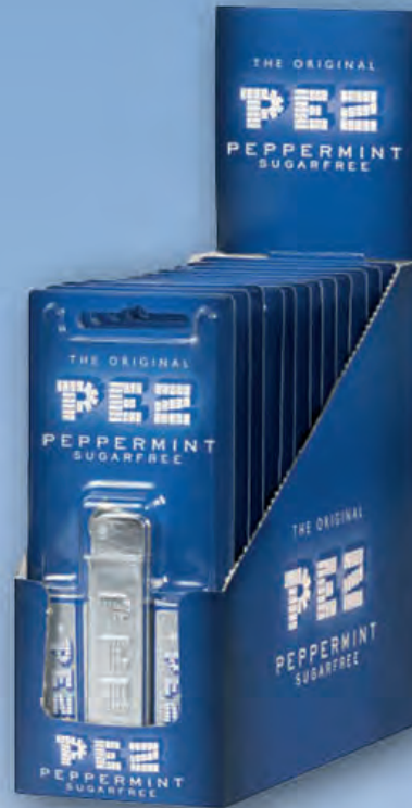
1/12 BLISTER 1+2