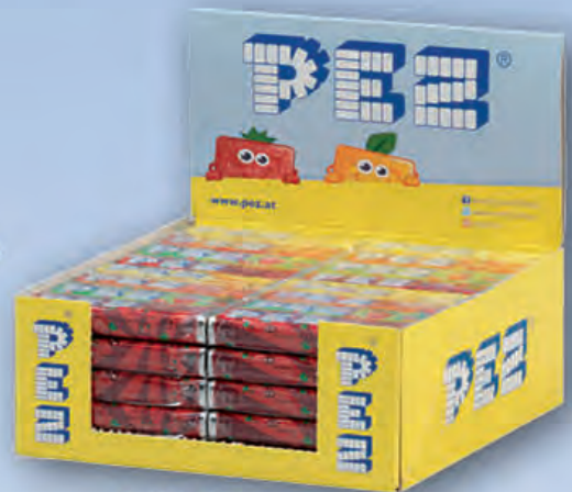
1/20 4-PACK Fruit Mix