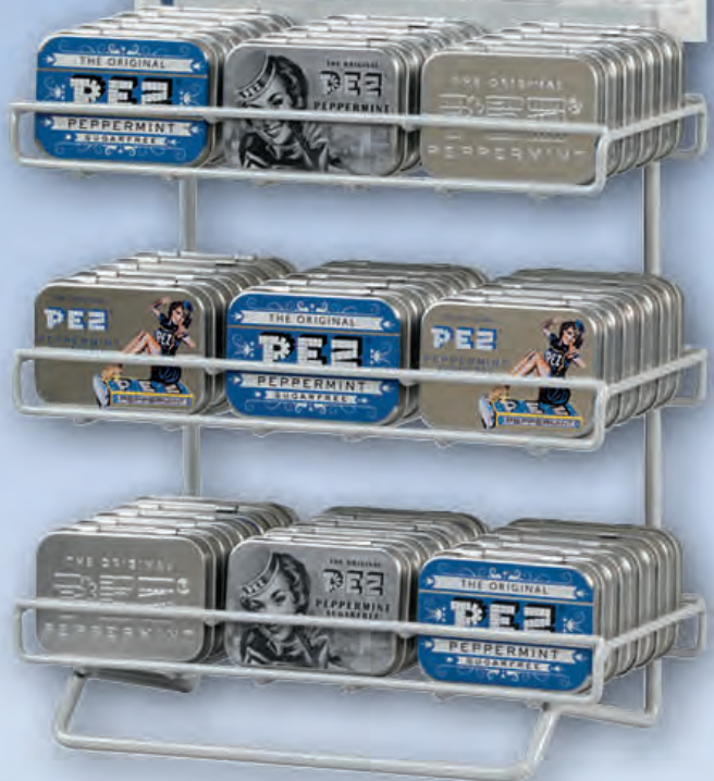
1/45 SHELF DISPLAY filled with tins 16g