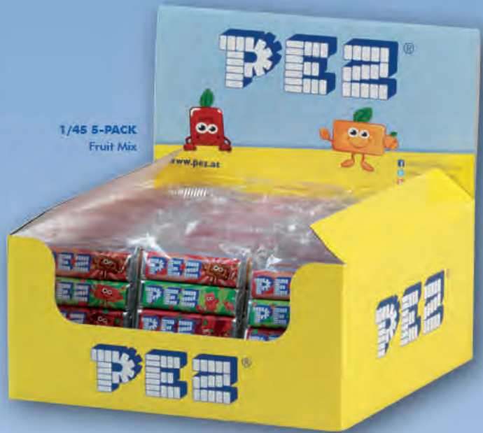
1/45 5-PACK Fruit Mix