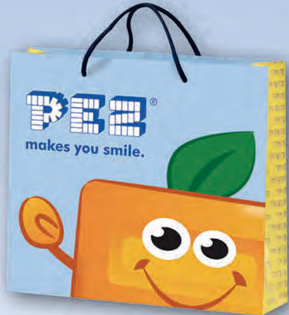
SHOPPER BAG WORLD