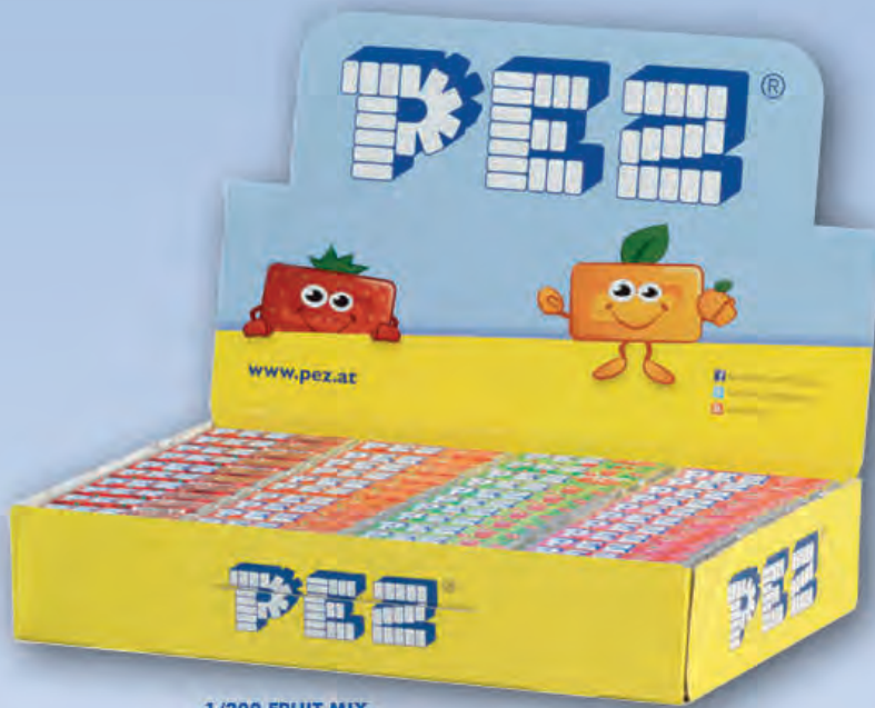
1/200 FRUIT MIX