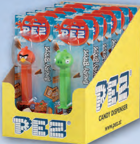
1/12 EUROBLISTER 2-FACING 1+3 also available for 1+2 and 1+1