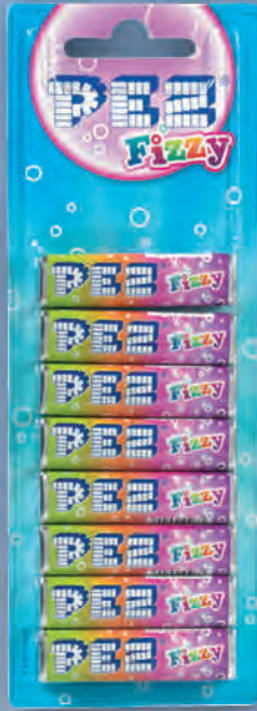
8-PACK EUROBLISTER Fizzy