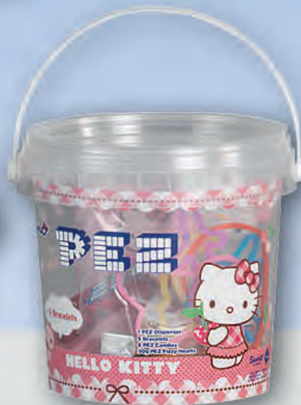
HELLO KITTY BUCKET