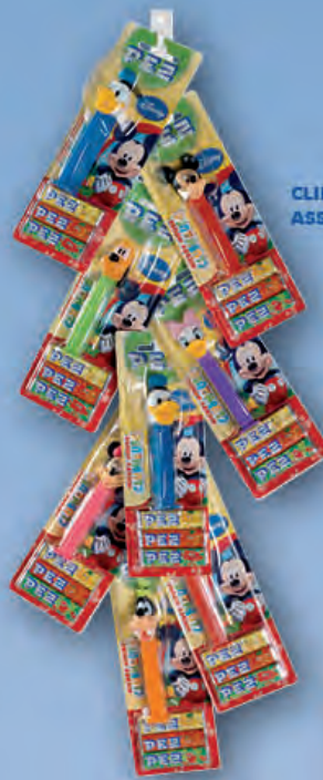
CLIP STRIP ASSEMBLED