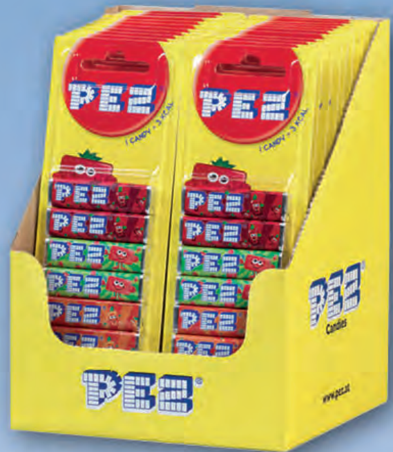
1/24 8-PACK OR 6-PACK EUROBLISTER FRUIT also available for Cola, Fizzy, Sour Mix and Mango Mix