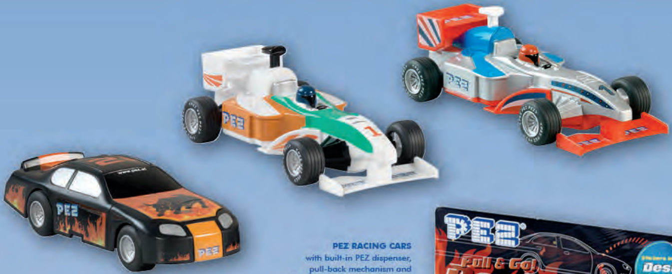
PEZ RACING CARS with built-in PEZ dispenser, pull-back mechanism and 2 x 4-packs of PEZ candy rolls.