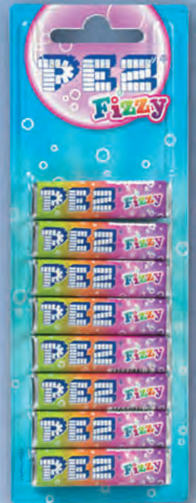
8-PACK EUROBLISTER PEZ FIZZY also available as 6-pack