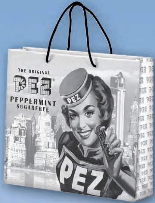
SHOPPER BAG PEPPERMINT