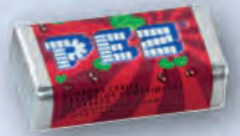
MINIS The little ones with the big taste.