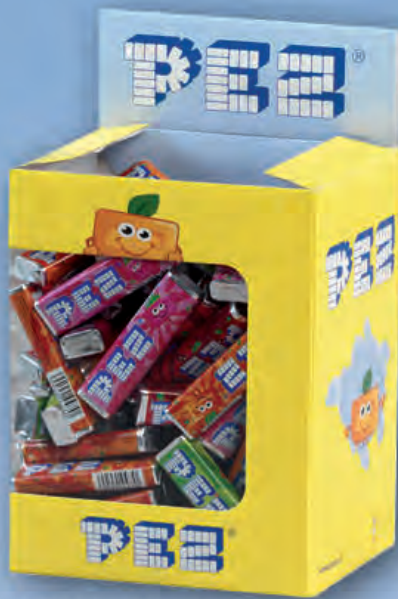
1/100 SINGLE REFILL FRUIT