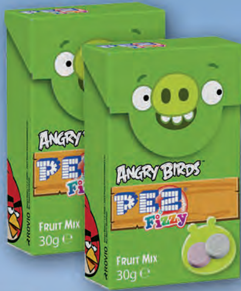
GREEN PIG 30g