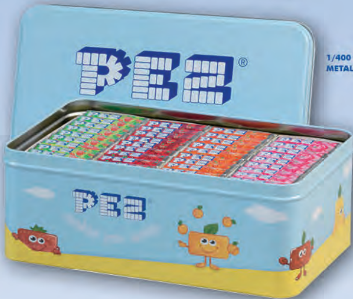
1/400 PEZ REFILL METAL CAN