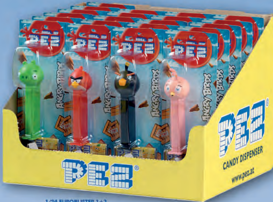
1/24 EUROBLISTER 1+3 also available for 1+2 and 1+1