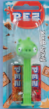
IMPULSE BLISTER 1+2