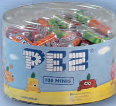
1/100 PEZ MINIS