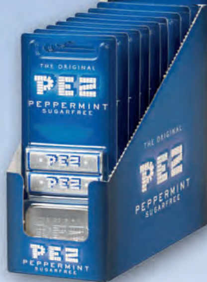
1/10 BLISTER 1+2