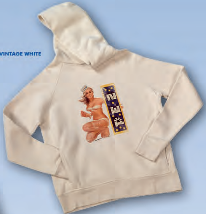
HOODIE VINTAGE WHITE