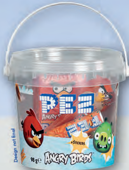
ANGRY BIRDS BUCKET