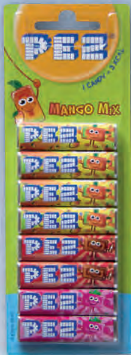
8-PACK EUROBLISTER MANGO-MIX